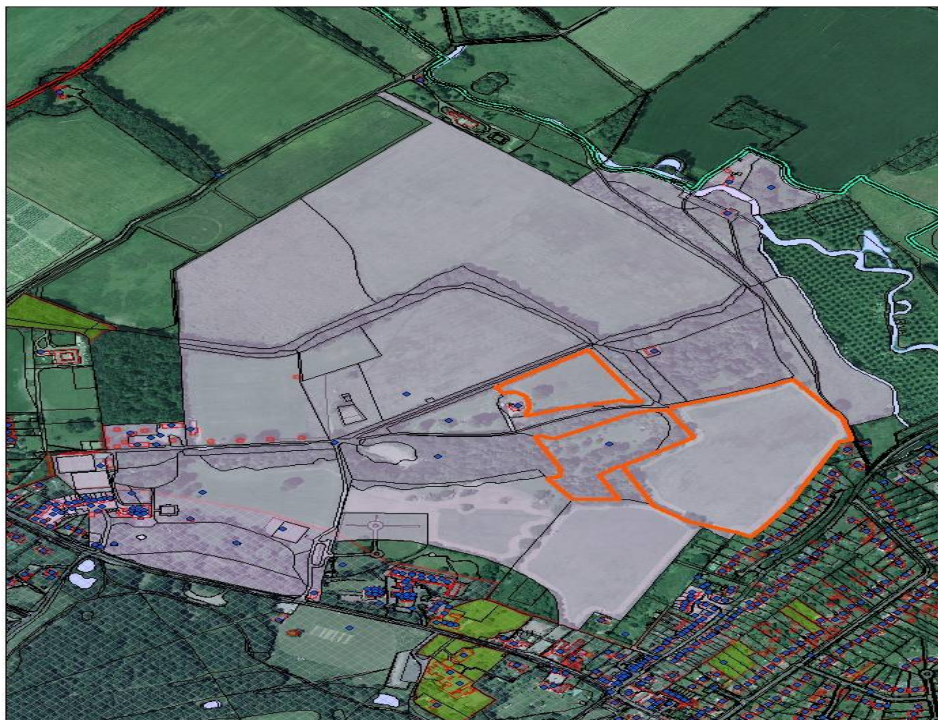
Chorleywood House Estate Local Nature Reserve

Reproduced with permission from the Ordnance Survey map with the permission of the Controller of Her Majesty's Stationery Office. Crown Copyright. Unauthorised reproduction infringes Crown Copyright and may lead to prosecution and civil proceedings. Three Rivers District Council.